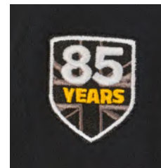
Side Arm Logo