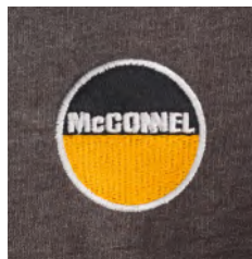
Front & Rear Logos

The McConnell logo is up front and centre. The 85 year anniversary logo is embroidered on the right arm of the sweatshirt.