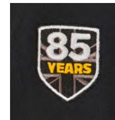
Side Arm Logo