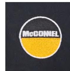
Front & Rear Logos

McConnel logos appear on the front and rear. The 85 year anniversary logo is also featured on the front.