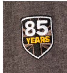
Side Arm Logo