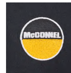
Front & Rear Logos

The McConnel logo is up front and centre. The 85 year anniversary logo is embroidered on the right arm of the shirt.