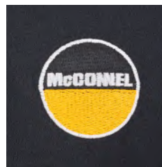
Front & Rear Logos

The McConnell logo is up front and centre. The 85 year anniversary logo is embroidered on the right arm of the shirt.